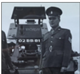
Winter 2020 Daimler Ferret