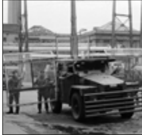
Spring 2020 Humber FV1611 'Pig'