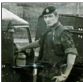
Spring 2021 Landrover Defender 110