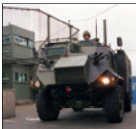
Autumn 2020 GKN Saxon