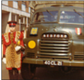
Summer 2020 Bedford MK