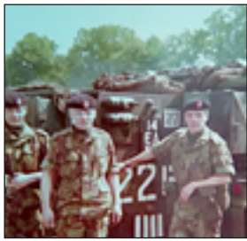
Winter 2019 Alvis Saracen